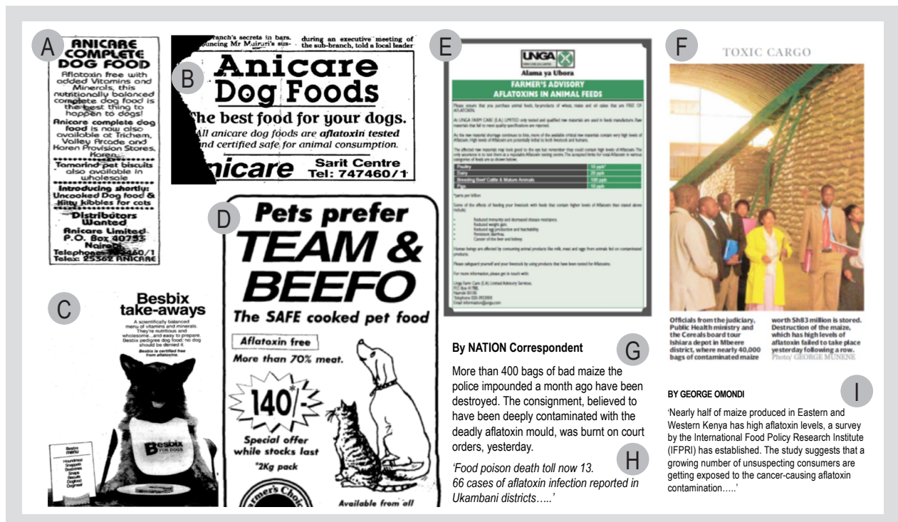
Figure 1. Examples of mentions of aflatoxins in print media: (A) 1985; (B) 1989; (C) 1993; (D) 1998; (E) 2008; (F) 2009; (G) 2004; (H) 2005; and (I) 2011. Early mentions in print media were related to pet food and animal feed.

peer-reviewed literature discussed previously and through media reports (Figure 1F, G, H, and I; Table 3). Table 3 lists media mentions and their thrust that depict an increase in reporting about aflatoxins over the years. Albeit regular aflatoxins contamination mentions in produce from Eastern and Nairobi provinces, the spread of reporting in other regions allude to a nationwide problem (Figure 2) rather than regional, and across various food commodities (Figure 3).